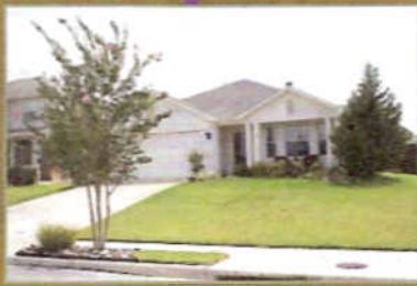
Linda Freeman 100 Pecanwood South